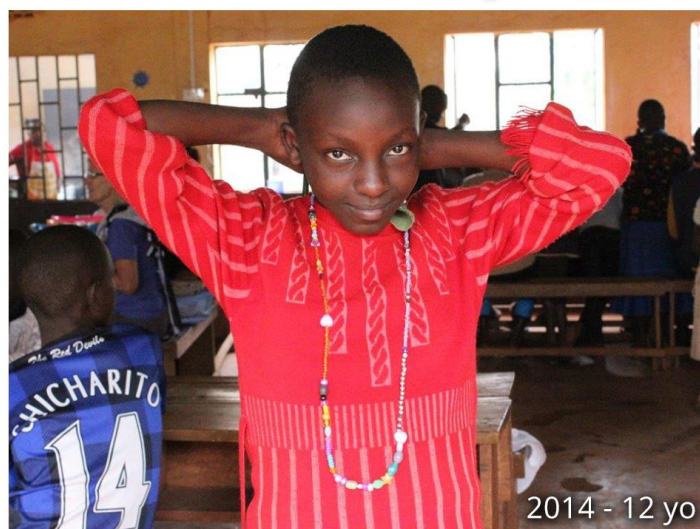
2014 - 12 yo