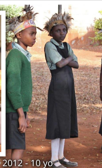
2012 - 10 yo