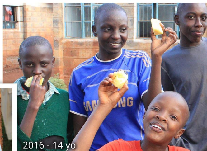
2016 - 14 yo