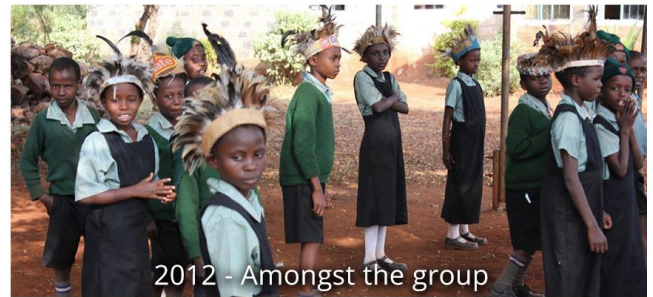
2012 - Amongst the group